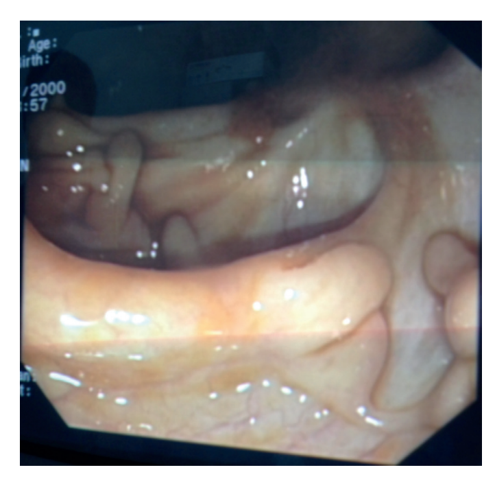
FIG. 1. Endoscopic appearance of filiform polyps in the colon.