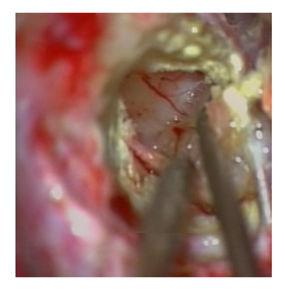
FIG. 3. Tumor was moved out of the internal auditory canal, and cranial nerves VII and VIII at the fundus were identified.