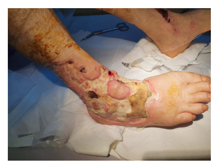
FIG. 2. Surgical debridement necrotic areas

SARS-COV2 infection through a real-time PCR test. A thoracic CT scan revealed left-sided ground glass opacity and pleural effusion, while head CT and Doppler ultrasound were normal, excluding giant-cell arteritis despite suggestive initial presentation.