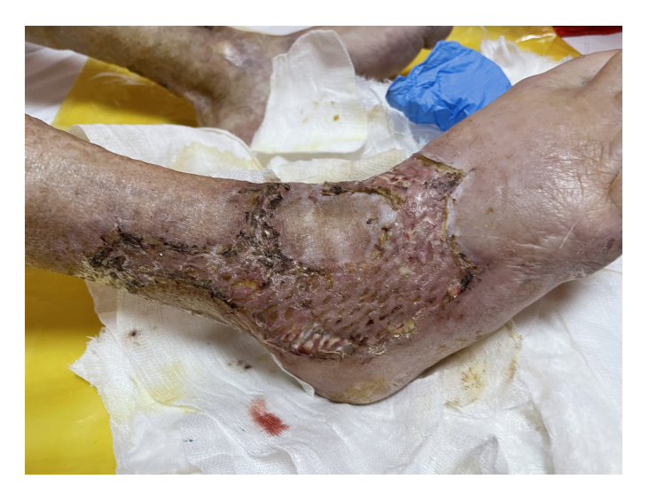
FIG. 6. Healing graft within recovery interval

with the predisposition toward thrombotic events, is familiar to all medical staff. However, atypical signs and symptoms are not uncommon, and the possible connection between this viral infection and vasculitis should not be ignored.