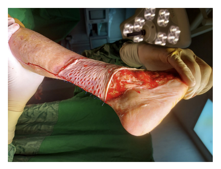
FIG. 5. Intraoperative image while grafting procedure

Since the beginning of 2020, the COVID-19 pandemic has been at the forefront of medical attention and research, with great strides being made in understanding this condition. By now, the typical disease presentation of fever, cough, and respiratory distress, along