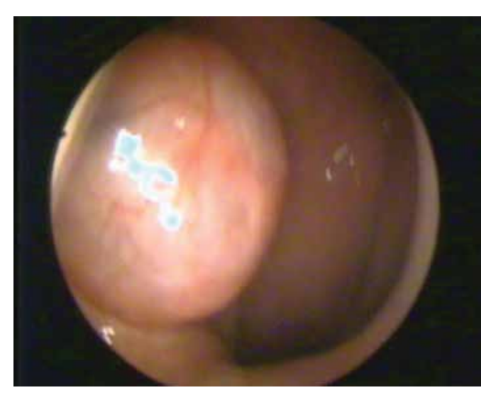
FIG. 1. Nasopharyngeal endoscopic examination of tumor

By histological analysis of the biopsy, the lesion was diagnosed as PA. The area that the PA originated from was seen in the right anterolateral side of the nasopharynx with the aid of 0-degree and 30-degree endoscopes (Karl Storz, Germany). The lesion was totally excised from its originated area with the help of the electro-