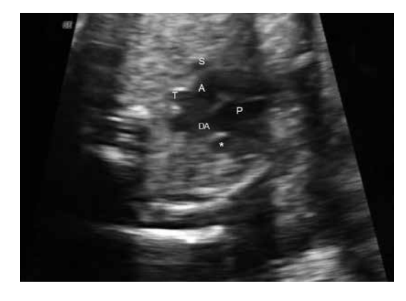
FIG. 1. Three-vessel-trachea view. Asterisk shows the persistent left superior vena cava located left of the pulmonary artery and ductal arch. (P: pulmonary artery; DA: ductal arch; A: aorta; T: trachea; S: superior vena cava)

This study was approved by the Institutional Ethics Committee of İstanbul Faculty of Medicine. Informed consent was obtained from all participants. The clinical data retrieved from hospital records, ultrasound reports and prenatal diagnosis databases include maternal age, gestational age at diagnosis, fetal gender, sonographic cardiac and extracardiac findings, genetic analysis, and outcome of pregnancy. The conditions associated with heterotaxy such as malposition of the abdominal viscera were not taken into account as extracardiac malformations. If prenatal or postnatal chromosome analysis was not performed, the karyotype was considered to be normal in healthy infants with no clinical findings. Prenatal diagnosis was confirmed by postnatal echocardiography or cardiac surgery in all surviving patients, and by autopsy in case of termination of pregnancy (TOP) or in utero death, except for the cases in which parents did not accept postmortem examination. For the five patients who did not attend to our hospital for postnatal examination, data regarding outcome was obtained by contacting the parents by telephone. The outcome was considered favorable if the infant was alive and doing well, while TOP, in utero death and neonatal death constituted unfavorable outcomes. Statistical analysis was performed using Fisher's exact test and the Mann-Whitney U test. All values are given as mean±SD. p<0.05 was considered to be significant.