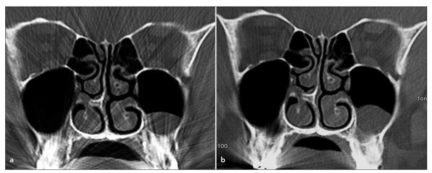
Figure 1. a, b. Coronal CT image (at the bone-window level) shows a homogeneous, dome-shaped cystic lesion with well-defined margin and low density consistent with retention cyst at the left maxillary sinus floor (a). One year later, follow-up CT image shows that the retention cyst increased in size (b).