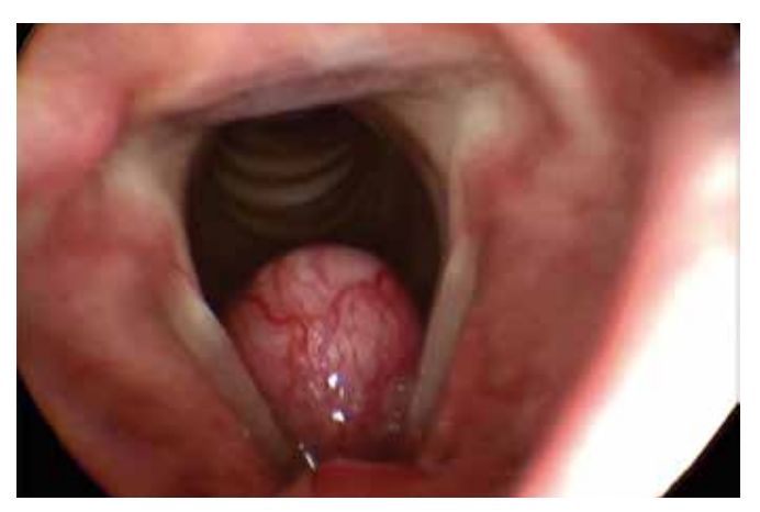
FIG. 1. On endoscopic examination, a round, well-demarcated lesion was noted midline at the level of the subglottis. The lesion was covered by dilated vessels.