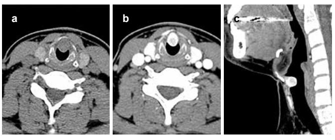
FIG. 2. a-c. Pre-contrast and contrast-enhanced CT images demonstrated a 1.3x1.0x1.3 cm round-shaped tumor located at the subglottic larynx without transglottic or extralaryngeal extension. Its density was similar to that of adjacent muscle on pre-contrast image (a) and became markedly increased, like that of the thyroid gland, on the contrast-enhanced images with a 40 second scan delay (b, c).