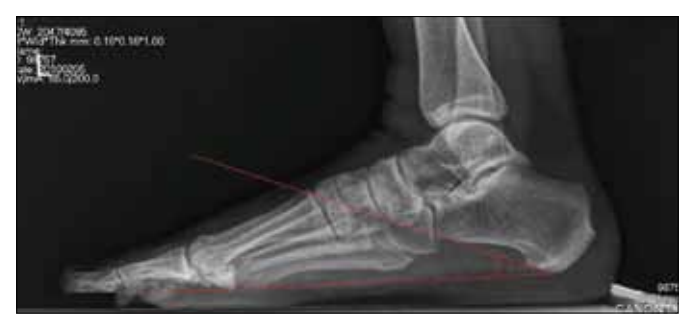
Figure 3. Lateral radiograph of foot showing the CPA

Surface area measurement of irregularly shaped structures by a point-counting method was described as an efficient approach for obtaining the required cut surface areas of the structure (8). The PAL method was previously suggested as an alternative to the Cobb method for the radiographic evaluation of the degree of lumbar lordosis when ImageJ's estimation was accepted as the gold standard (9). Authors stated that the Cobb method caused variability in the measurements because of vertebral end plate architecture variability, and offered that the PAL method may be a useful technique for the evaluation of the surface area of the semilunar region for lumbar lordosis (9). They argued that, because of the good agreement between planimetry and point-counting methods, the PAL method could be applied without requiring any software. The current study indicated that the PAL method can be used as an alternative method for measuring the semilunar irregular shape of the MLA in weight bearing lateral roentgenograms of the foot.