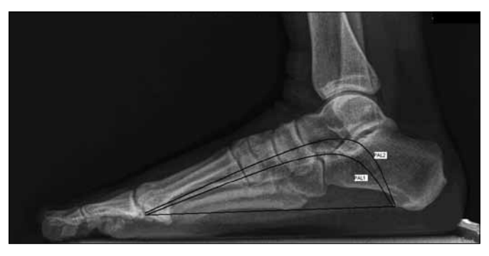
Figure 1. Lateral radiograph of foot showing the area drawn for the estimation of Projection area per length (PAL1 and PAL2)

Projection area per length squared (PAL)=[(a/p × \Sigma P) / l^2 ]×100, where \Sigma P denotes the point counts, (a/p) represents the area associated with each test point, and (l) is the measured length of the straight line between the most plantar process of the calcaneus and the head of the first metatarsal bone.