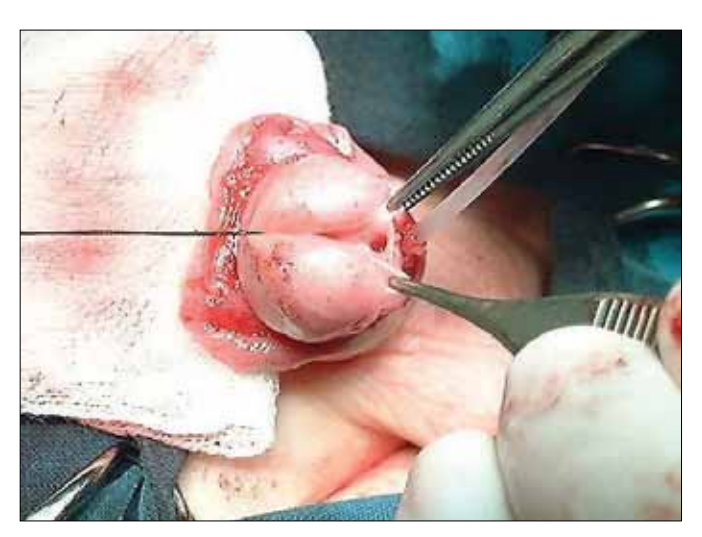
Figure 1. Intraoperative view of the hypospadiac ventral urethral orifice and duplicated urethral meatus