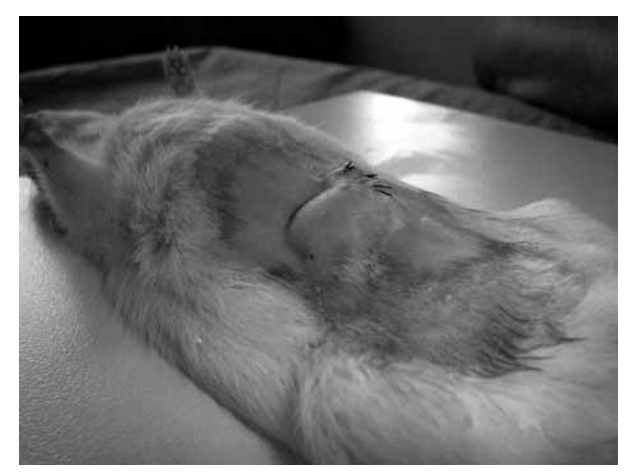
Fig. 1. The appearance of subjected strangulated hernia in a rat.

Blood samples were collected by cardiac puncture into tubes containing 0.123 mol/L sodium citrate. Plasma was separated by centrifugation at 3000 g for 10 min and stored at -70°C until assay. A latex agglutination test (D-di Test®, Diagnostica Stago, France) was used for D-dimer measurements. Values of <0.5 \mu g/ml were considered normal, since the D-di Test reacts with the levels of >0.5 \mu g/ml. Leucocytes, neutrophils, platelets and lymphocytes were measured on ABX-PENTRA 120 DX® Hematology Analyzer (ABX Diagnostics, France). Biochemistry testing, including AST, ALT, LDH, ALP, CPK and D-Dimer was measured by UV-kinetic method with Olympus AU 2700® autoanalyzer (Olympus Diagnostics GmbH, Hamburg, Germany).