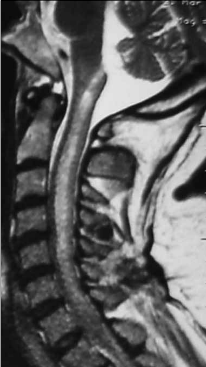
Figure 3. T2 Sagittal Servical MR Image Shows Longitudinally Extensive Myelitis

for a few minutes. The clinical differential diagnosis for stereotyped tonic spasm includes epileptic seizures, psychogenic attacks, carpedal spasm (tetany), paroxysmal kinesogenic choreoathetosis, and paroxysmal dystonic choreoathetosis, and the tonic spasms of demyelinating disease. Because of normal initial and ictal EEG, in our case clinical signs and corresponding EEG findings were characteristic for tonic spasm.