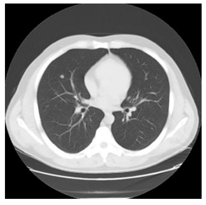
FIG. 3. There is a parenchymal solitary pulmonary nodule in the middle lobe of the right lung.

The main limitation of our study was that 79% of pulmonary involvement workers were smokers. Smoking is one of the factors affecting DLCO. At least 24 hours before the DLCO test, patients should refrain from smoking; however, not all patients comply with this warning. As a result, smoking may contribute to the decline in DLCO in pulmonary involvement patients.