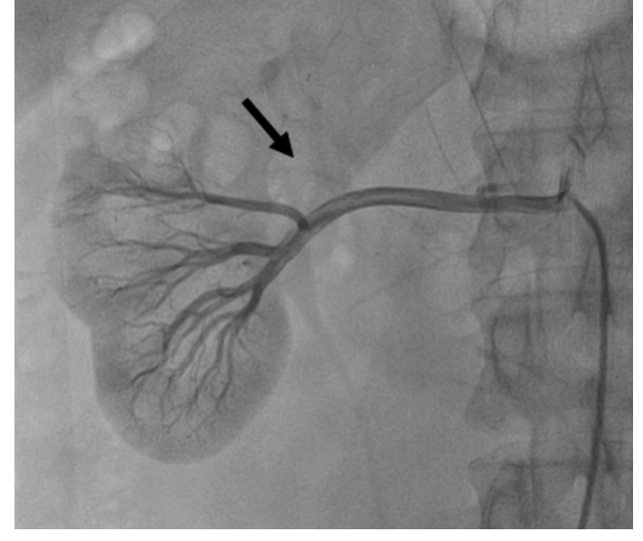
\textbf{FIG. 2.} \ Selective \ renal \ angiography \ showing \ 80\% \ stenosis \ in \ the \ middle \ inferior \ segmental \ renal \ artery.