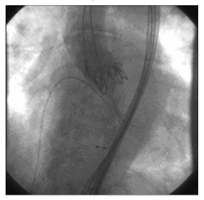
Figure 3. Checking the percutaneous valve after the balloon is deflated

Edwards-SAPIEN-THV is a valve with a stainless steel frame and bovine pericardial tissue. Three different sizes of 23, 26 and 29 mm are available in the market; TAVI-transfemoral implantation is performed with 18-F, 22-F and 24-F cannula systems. A 33-F cannula system is required for the TAVI-transapical procedure (Figure 3). A balloon-expandable SAPIEN valve, used during TAVI-Transfemoral and TAVI-transapical implantation, should be implanted under high frequency right ventricular stimulation [rapid pacing] to allow for its stable insertion