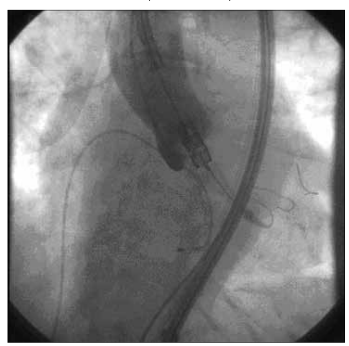
Figure 1. Positioning of Percutaneous Aortic Valve to the retrograde (transfemoral procedure) original valve position

In cases where vessel size is adequate (>7 mm), the procedure is generally performed by a puncture at the A. femoralis communis. Surgical opening of the vessel is mostly not required with the use of the percutaneous suture system (Pre-Closure, e.g.: ProStar XL, Abbott Vascular). Therefore, general anaesthesia is not applied in many of the cases and intervention is performed with analgo sedation (e.g. Midazolam and Propofol) under regular conditions. The major determinant of TAVI- transfemoral intervention is to make a careful puncture in the vessel at an adequate distance from the bifurcation. The evolution of the inserted cannulas provides a decrease in the vascular complications experienced in the past. A steerable catheter has been developed for the implantation of the SA-