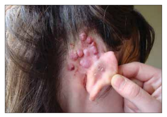
Figure 1. Numerous dome-shaped erythematous soft papules in the postauricular region of the right ear