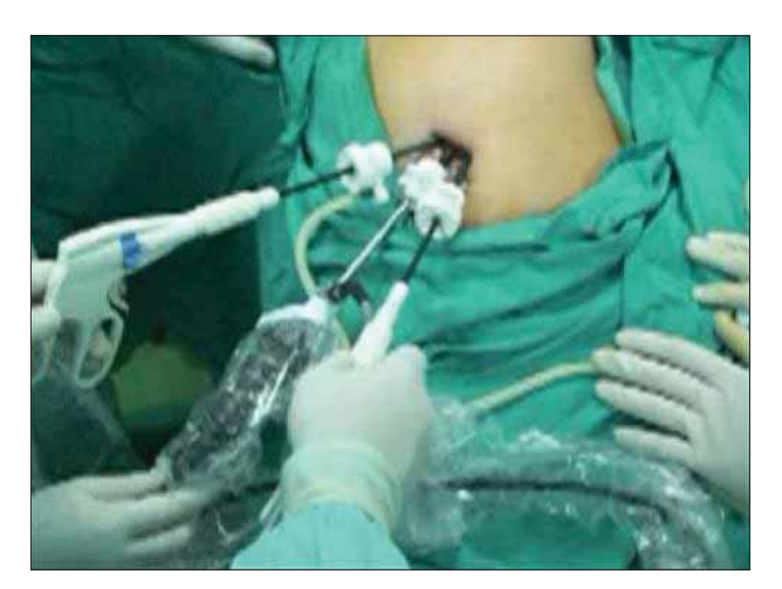
Figure 1. Transumbilical three 5 mm trocars

Although SILS practice is relatively new, it has already been applied in many surgical procedures by ambitious surgeons who always look for the best option. Many procedures such as