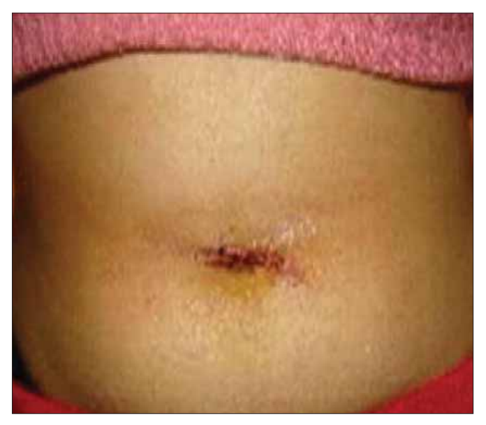
Figure 4. View of the umbilicus postoperatively