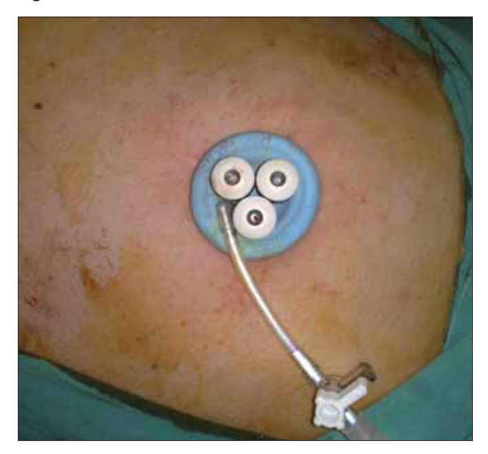
Figure 2. Special SILS trocar