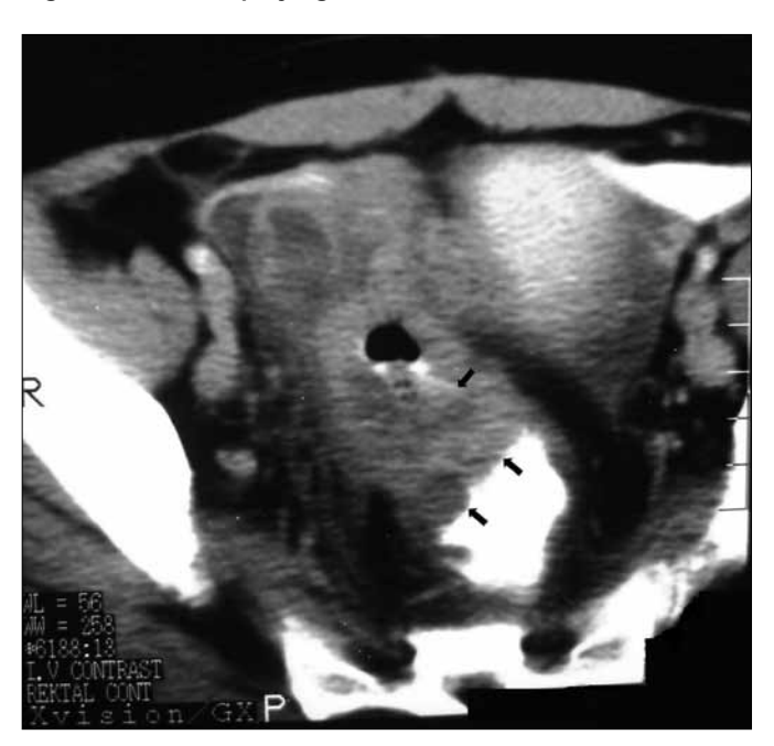
Figure 2. CT Showing Gossypiboma Protruding Into the Rectum (Arrowheads)

ent case, it had caused abdominal pain and diarrhea followed by protrusion of the foreign object from the rectum.