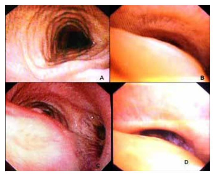
Figure 1. The fiberoptic bronchoscopic images of case 1. While the morphology of the tracheal lumen was normal in figure A, in figure B it is seen that the sagittal diameter of the trachea collapses about 90%, in a crescent shape. C, view from inside the right main bronchus at the carina of the right upper lobe level, during expiration. In D, the left main bronchus at the carina level is seen, with crescent shaped excessive dynamic airway collapse

A review of the literature indicates that the cases undergoing bronchoscopy have a 4-23% overall diagnosis of EDAC or TBM (2, 3). Acquired TBM and EDAC may arise due to primary or secondary reasons. Secondary reasons are reported as long-term intubation and mechanical ventilation; undiagnosed tracheal cartilage fractures following closed chest traumas, especially steering-wheel injuries; chronic inflammations like relapsing polychondritis; tracheal cartilage damage due