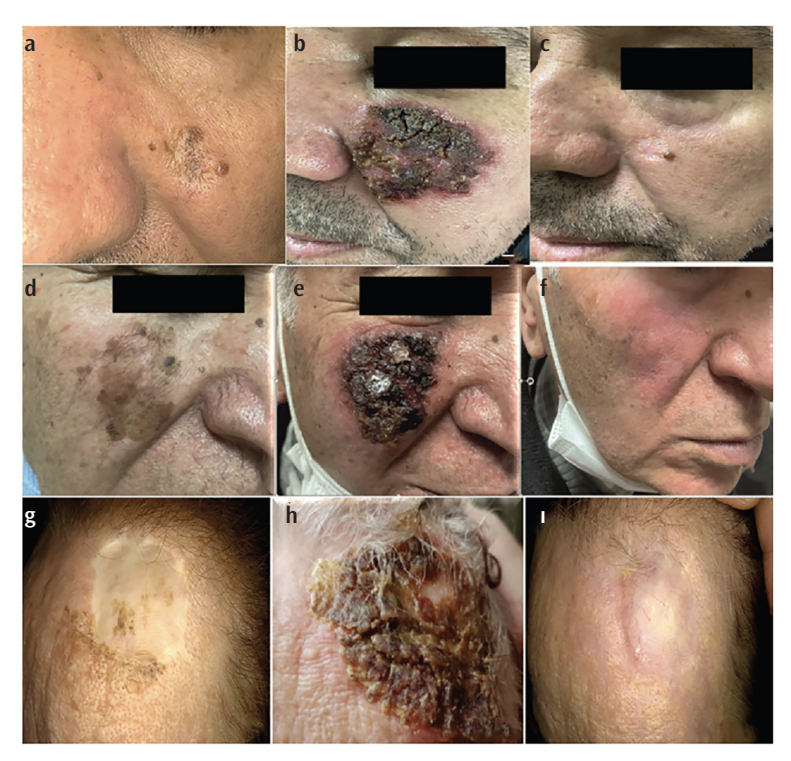
FIG. 1. Case 1: Initial presentation (a), severe inflammation during treatment (b), and complete resolution after treatment (c). Case 2: Initial presentation (d), severe inflammation during treatment (e), and complete resolution after treatment (f). Case 3: Initial presentation (g), severe inflammation during treatment (h), and complete resolution after treatment (i).