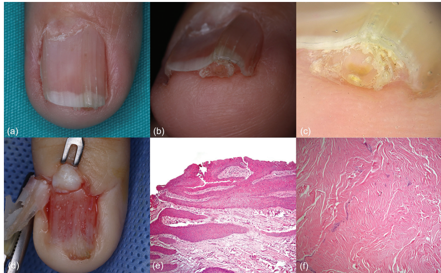
FIG.1. (a) Longitudinal erythroxanthonychia and asymmetric elevation of the nail plate on the right third fingernail. A firm, fixed subcutaneous nodule (~8 mm) is visible beneath the proximal nail fold, with medial depression and lateral elevation. (b) Clinical close-up showing a subungual hyperkeratotic mass (~5 mm) beneath the distal free edge of the nail. (c) Dermoscopy reveals a well-circumscribed distal subungual hyperkeratotic mass, a hallmark feature of onychopapilloma. (d) Intraoperative view following wing block and matrix anesthesia, showing avulsed nail plate and excised proximal mass along with a longitudinal band extending toward the distal hyperkeratotic lesion. (e) Histopathology of the distal nail bed lesion revealing acanthosis and focal papillomatosis of stratified squamous epithelium, consistent with onychopapilloma (H&E, \times 200 ). (f) Histopathology of the proximal lesion demonstrating thick collagen bundles forming a loose storiform pattern, consistent with ungual fibroma (H&E, \times 400 ).